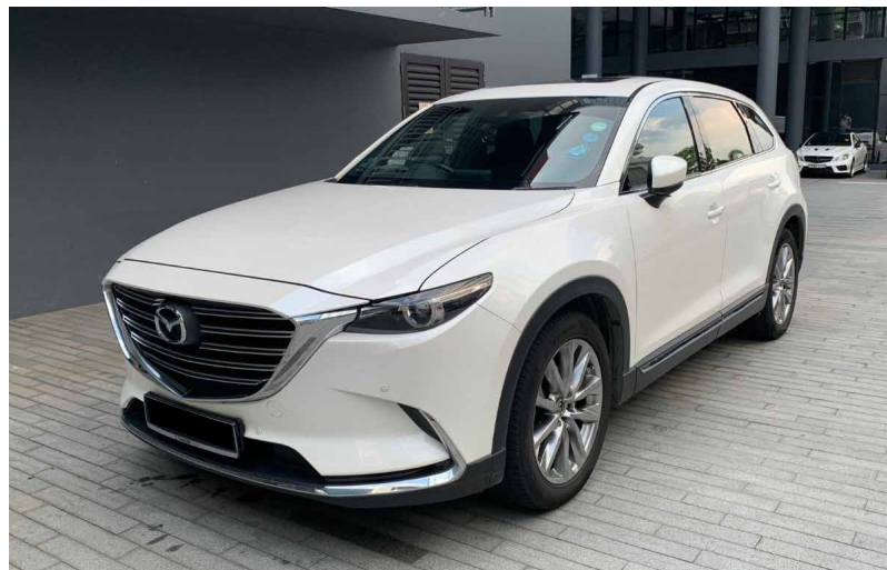
Side profile should take up about 75% of the picture.