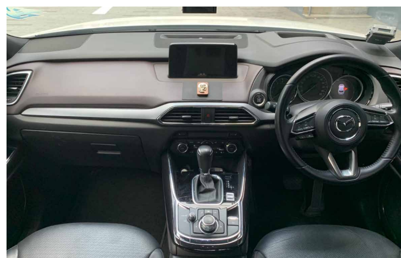
Hop into the back seat and shoot from above a view of the legroom and dashboard.