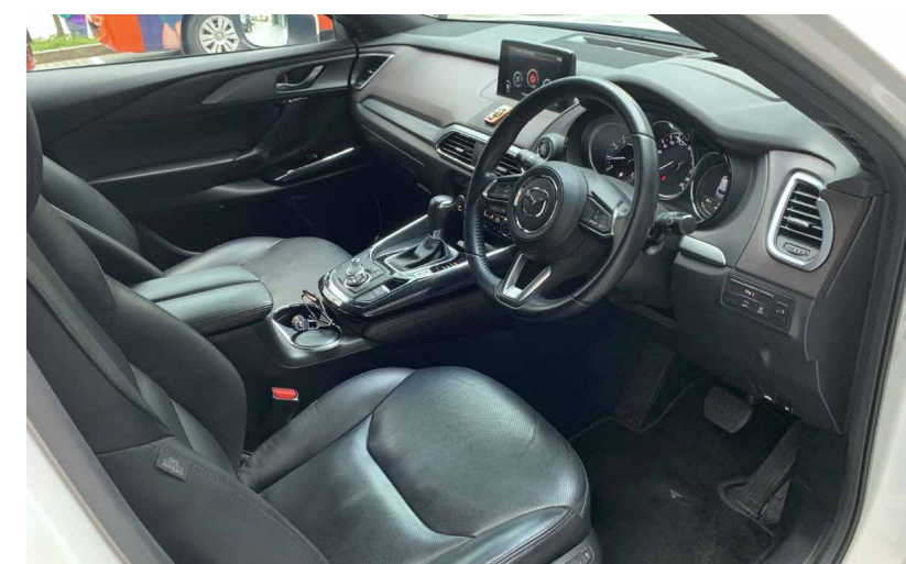
A photo showing the legroom of the front seat.