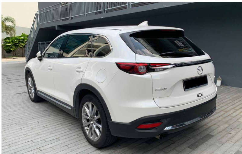
Angled back view with 75% of side profile.