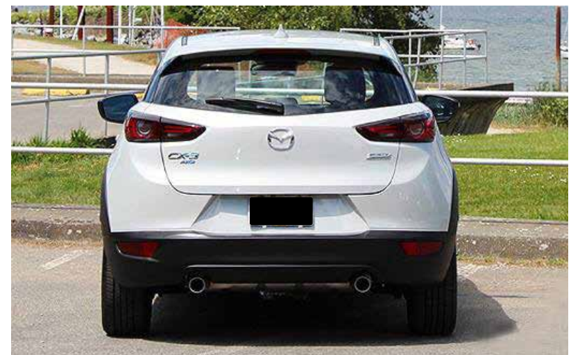
Take a photo of rear bumper.