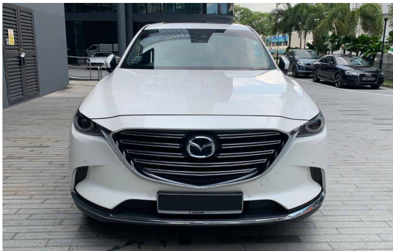
Take a photo directly in front of your car!