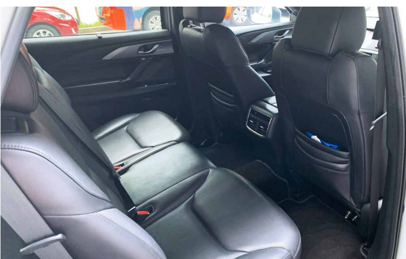
Take a brightly lit photo to show case the legroom.